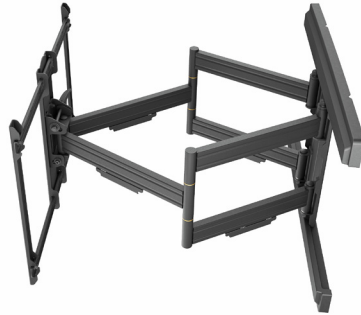
Heavy-Duty Full Motion Mount AD-WM-7060

Dual arm mount for heavier displays and longer reach