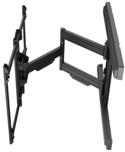
Full Motion Mount AD-WM-5060

Single arm full motion wall mount, displays to 50kg (110lb)